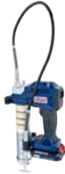
20 V Li Ion PowerLuber Model 1882

Lincoln's PowerLuber family includes a full range of battery-operated grease guns, including NiCad and Lithium-ion-powered tools, as well as pneumatic and electric options. Developed by the lubrication experts, the PowerLuber line has the right grease gun for your needs.