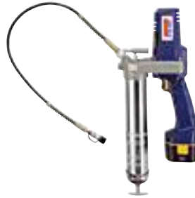
12 V PowerLuber Model 1242