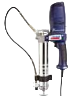
120 V AC PowerLuber Model AC2440