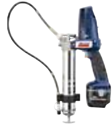
18 V NiCad PowerLuber Model 1842