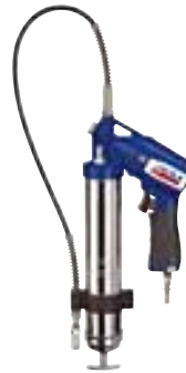
Pneumatic PowerLuber Model 1162