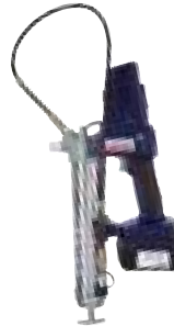
18 V Li Ion PowerLuber Model 1862